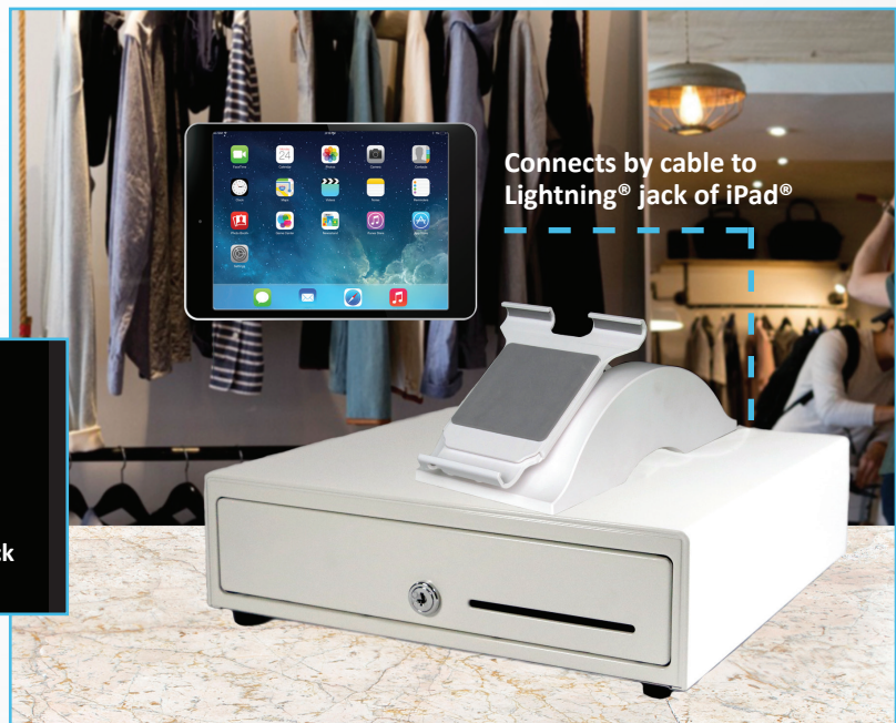
Connects by cable to Lightning® jack of iPad®